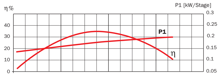
Curvas de funcionamiento a 2900 r.p.m. Performance curves at 2900 r.p.m.